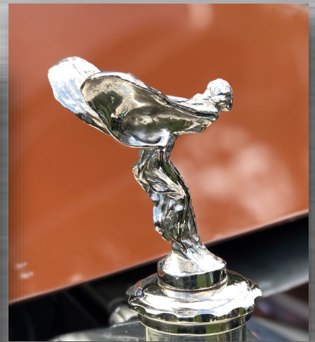
1926 Rolls Royce