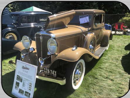
Roy Asbahr-1932 Studebaker